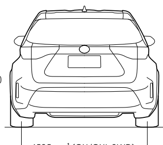
← 1525mm<sup>1</sup> (GX/GXL 2WD)→ 1520mm<sup>1</sup> (GX/GXL AWD) 1515mm<sup>1</sup> (Urban/GR Sport AWD) 1510mm<sup>1</sup> (Urban AWD)